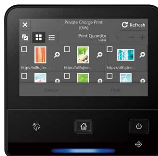
5-inch colour touch panel